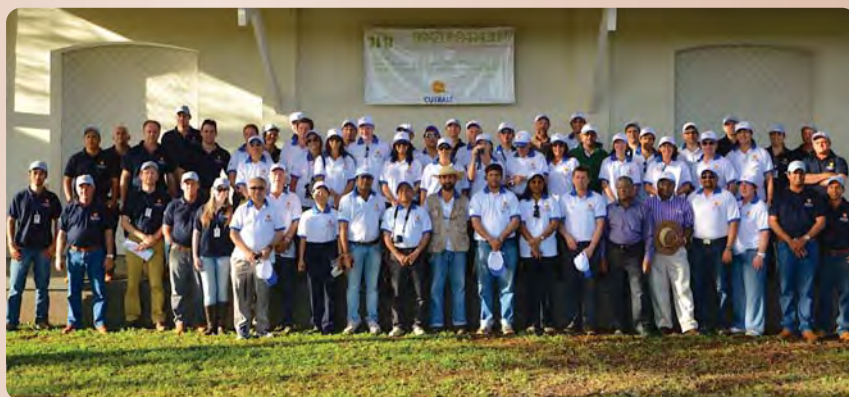
A superb collection of photos was collected from the recent Brazil/Paraguay Study Tour, which will be stored in the IFEAT archive collection

(email pgifeat@yahoo.co.uk ) who is building up a detailed list of the whereabouts of existing material with a view to getting it digitalised and thus available in electronic format.