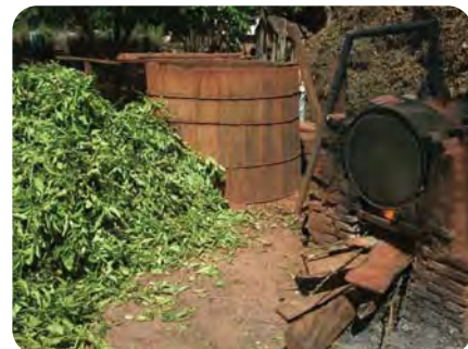
Petitgrain leaves awaiting distillation