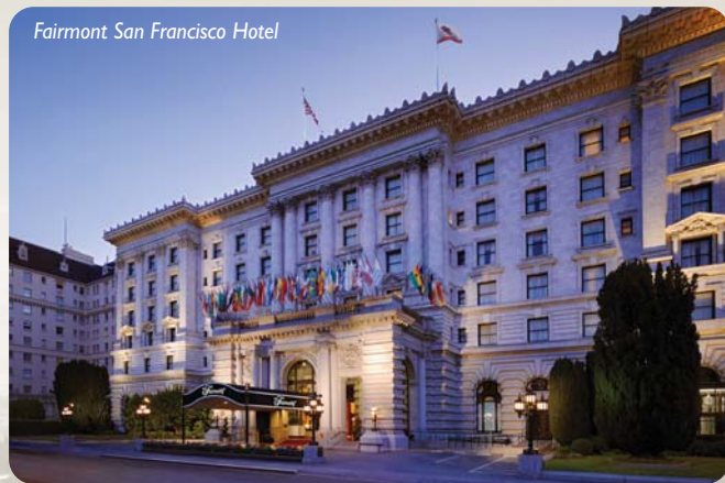
Fairmont San Francisco Hotel

The conference will take place at the world-renowned and historically important Fairmont San Francisco hotel. Centrally located on Nob Hill, this very large, luxury hotel is a short cable car trip from many of the main tourist attractions within San Francisco including the Financial District and Fisherman's Wharf. It also offers panoramic views of the city and San Francisco Bay.