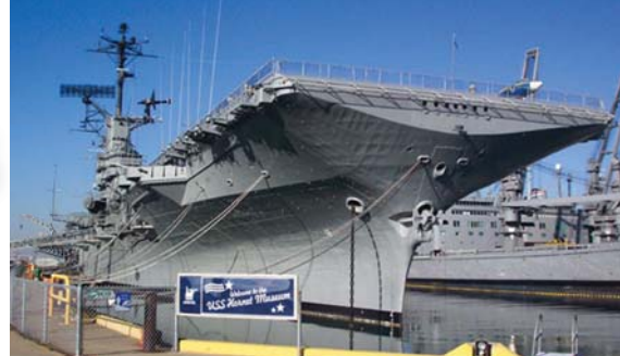
USS Hornet, venue for the IFEAT Dinner

This course will be held on the Wednesday of the IFEAT Conference, to be run by Brian Lawrence. After a brief introduction to essential oils, their method of isolation as well as that of extracts will be described including the economics of menthol and sclareol isolation. Variance in essential oil composition can be inherent or it can be from adulteration; as a result the analytical techniques used to determine adulteration using various oils as examples will be described. Finally, the compositional variances of a number of complex oils such as vetiver, rose, kaempferia, oud, kewda etc. will be discussed.